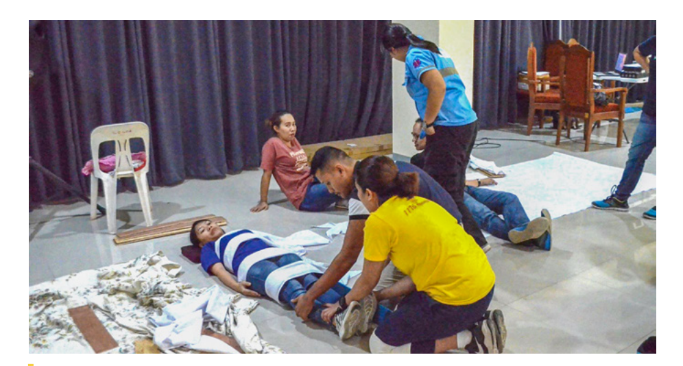
First Aid Training participants actively demonstrate the various techniques on bandaging.