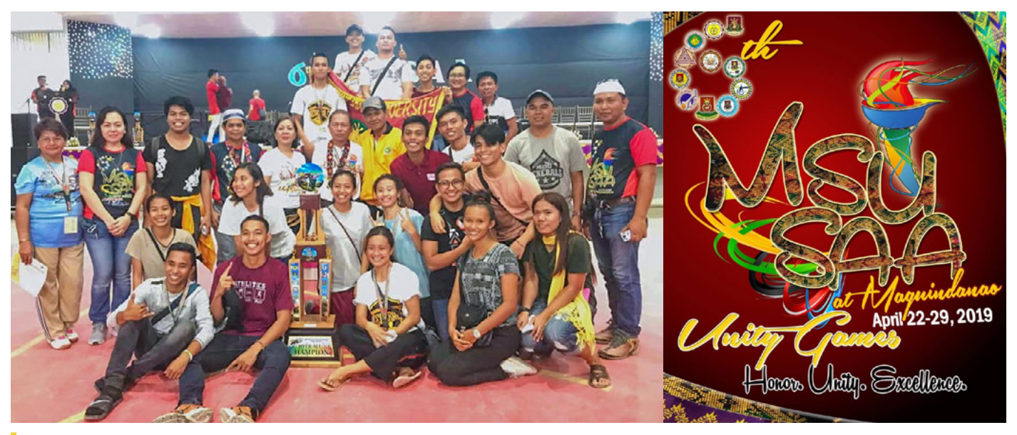
MSU-GSC delegates took a photo-ops at the MSUSAA Unity Games in Datu Odin Sinsuat, Maguindanao.