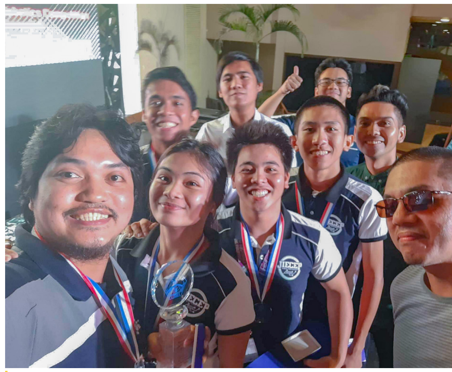
"We are the champion" - MSU-GSC Team strikes a pose for a selfie.