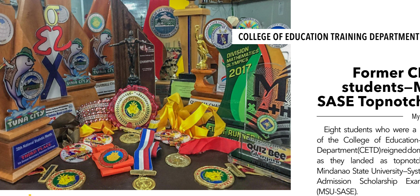
Pride of MSU-CETD for seizing the acme in Mathematics competitions.